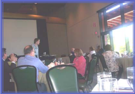
Participants candidly expressed their business needs at the 2007 employer forum at Independence Grove in Libertyville.

It takes the support and input from community leaders and employers to build a strong workforce development system. In June 2007, at the Workforce Investment Board's first employer forum, we asked Lake County employers to identify their business needs and tell us how we can assist them in addressing their needs. As part of the Board's 2007 strategic business plan, we made a commitment to develop a stronger relationship with Lake County employers and provide them with services that focus on their needs in today's changing workplace. It is with gratitude and pride that we invite you to review this Annual Report that highlights the Board's successes for 2007. We thank you for your continued support and participation.